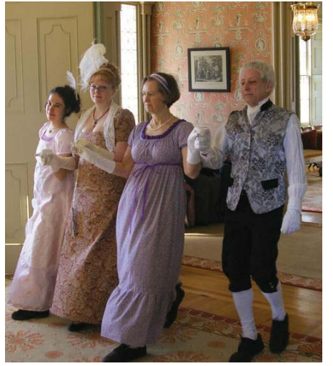
Meryton Assembly Dancers