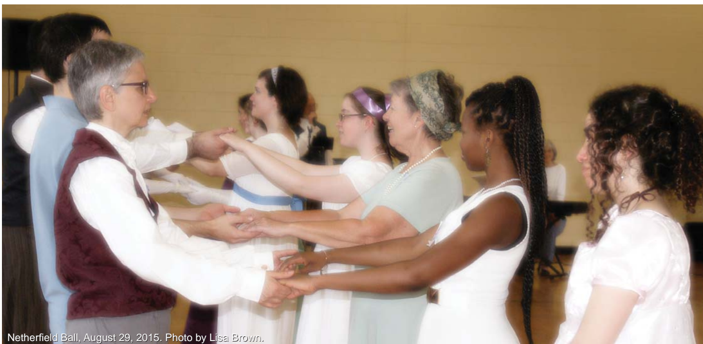
Netherfield Ball, August 29, 2015.