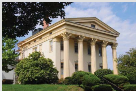
Jonathan Child House.

This year music will be provided by the ever popular Serendipity. These fine musicians have often played at our Sunday night dances and promise an evening of music both lively and elegant.