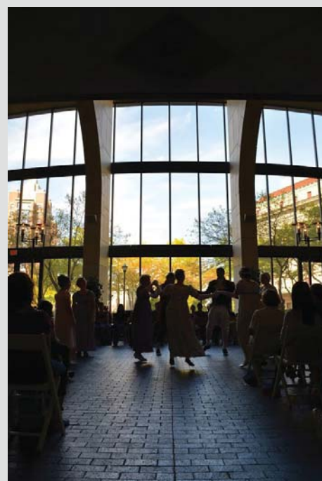
Meryton Assembly Dancers.

ARMING FOURCOUPLESET RIGHTHANDTURN BACKTOBACK GATE RIGHTSANDLEFTS BALANCE GIVEWEIGHT SETTING BAND GYPSY SIDING BELOW HALFWAY SKIP BOTTOM HANDSFOUR SLIP BOW HEY SQUARE CALLER HONOR STAR CAST IMPROPER THREECOUPLESET CIRCLE LEFTHANDTURN TOP CLOVERLEAFTURN LONGWAYS TRIPLEMINOR CORNER MIRRORHEY TURN SINGLE CROSS NEIGHBOR TWOHANDTURN CURTSEY NOHANDS UPADouble DANCER PARTNER USADANCE DUPLEMINOR POUSETTE WALTZ FIGUREEIGHT PROPER