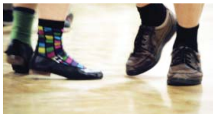
Thursday Night Contra.

Let's give thanks to Covenant Methodist Church for taking such good care of us! The church recently refinished the wood floor in the main hall for Thursday Night Contra, so now the wonderful sprung floor is beautiful once again. Thanks also to the anonymous CDR donor whose generous gift helped make this important update possible.