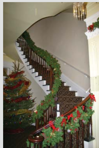
Jonathan Child House.

For more information see the website www.cd-rochester.org . Registration will be taken online until the event reaches capacity.