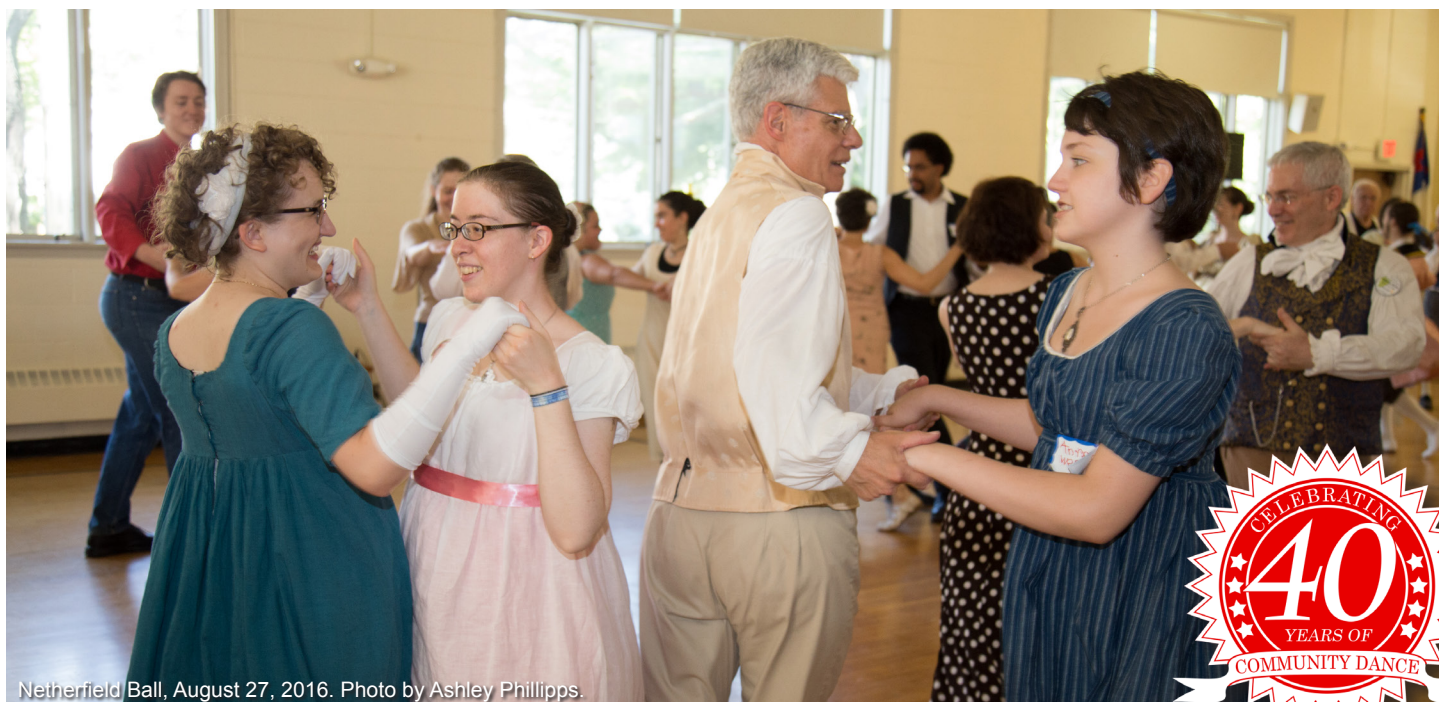
Netherfield Ball, August 27, 2016.