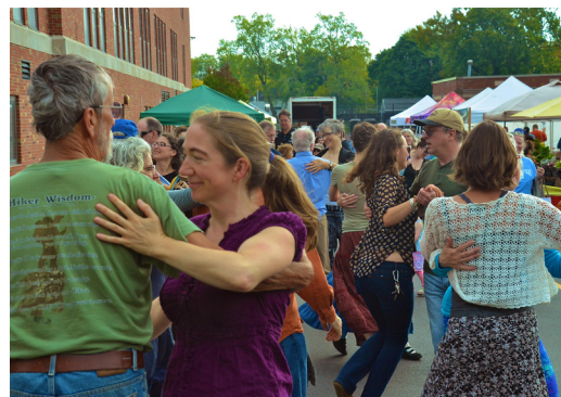
Flash Mob.

The Brighton Farm Market was the site of a Contra Dance Flash Mob on Sunday, October 16. It was unseasonably warm and pleasant for mid-October with a large crowd at the market. More than 24 contra dancers showed up and a few shoppers joined in the dance. WildRoot String Band provided music and Evan De Smitt called three dances. Since contra dancing is a form of community dance, it felt just right to be dancing at a community market. Laughter and smiling faces abounded, both from the dancers and the observers. We may see some of those observers at our upcoming dances, as all 20 of the informational handouts were picked up at the event! Many thanks to everyone who participated.