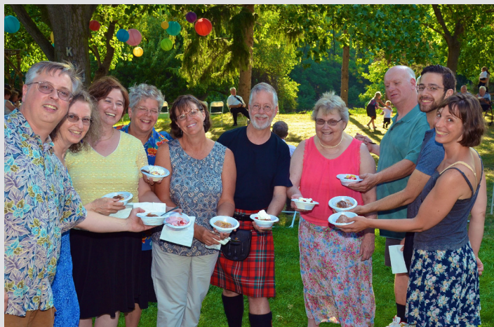
Dancers at the wedding contra.

I'd just like to say THANK YOU to everyone who accepted our open invitation to our wedding contra and ice cream social - You made our special day even more so! It was wonderful to be able to celebrate with all of our dance friends, and I loved seeing you mix and mingle with our (mostly non-dancing) family. You really showed them what the Contra community is all about! I hope you had as much fun as we did - thanks again for being such an amazing group of friends!