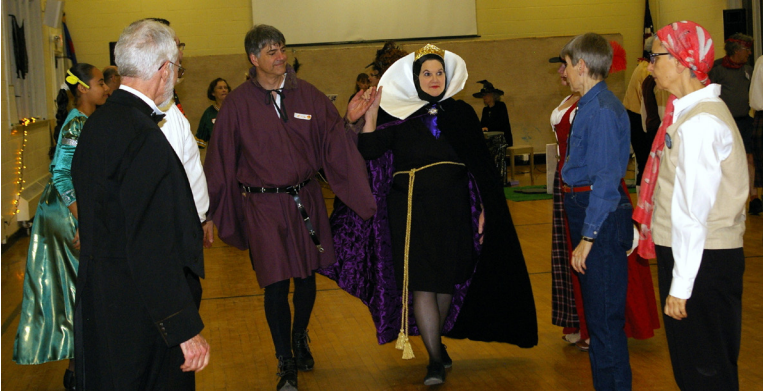
Masquerade Ball, Saturday October 29, 2016.