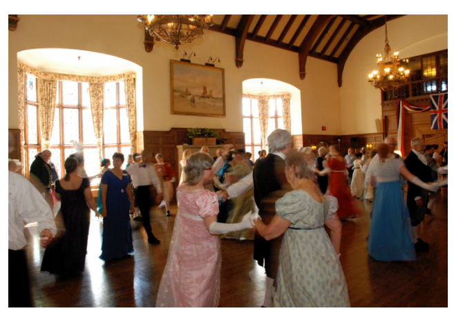
Sixth Annual Jane Austen Ball.

Inside a brilliantly lit ballroom and spacious dining and changing facilities will support a day of elegant dancing. New this year is an optional breakfast, a lunch of three courses and a break with delicious period treats will nourish dancers throughout the day.