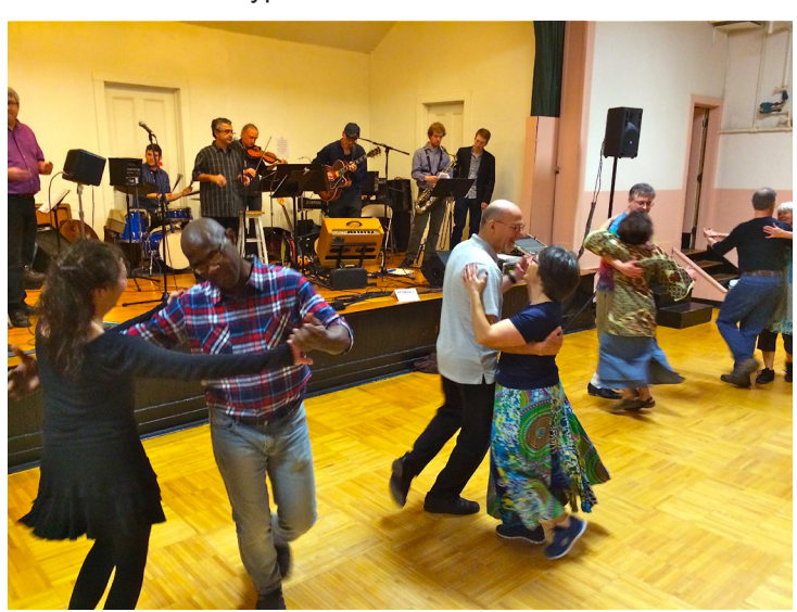
Blue Dance, February 2, 2017.

Two evenings during the last full weeks of January were spent with Blue Dance, listening and observing multitalented musicians shape popular tunes to fit within the framework of contra dance. What happens when you take Van Morrison's "Domino" and square it to fit 64 bars of music? Or Lou Rawls' "You'll Never Find Another Love Like Mine" or The Beatles' "While My Guitar Gently Weeps"? Each tune set evolved into a particular feel: some smooth, some swingy, some more rock and roll or calypso in beat. How does a caller work with such variety of musical genres?